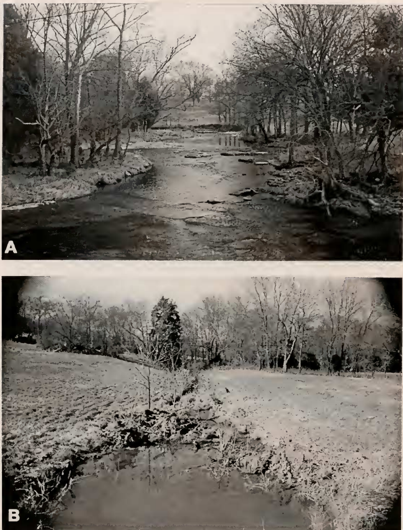
Figure 1. Photographs of (A) the East Fork of Bledsoe Creek looking upstream from the Chipman Road Bridge at Chipman, N36^{\circ}26'54'' W 86^{\circ}16'37'' , and (B) an unnamed tributary to the East Fork of Bledsoe Creek looking downstream from the Homer Scott Road Bridge southeast of Chipman, N36^{\circ}26'17'' W 86^{\circ}16'14'' (TN: Sumner Co. 1/2-III-2001).